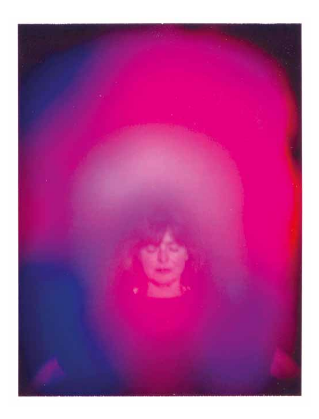
Aura photography of the author, 1994